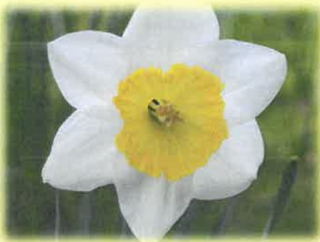
Narcissus Mabel Grey